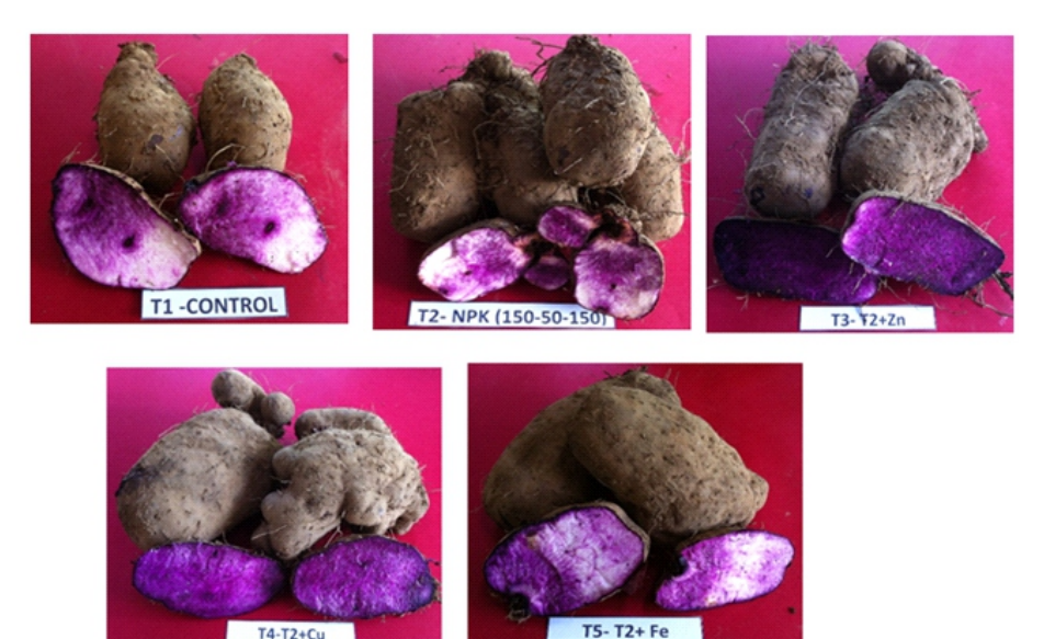
Figure 3. Harvested purple yam tubers as affected by micronutrient biofortification

These results further signify the vital contribution of micronutrient biofortification to the yield of yam tubers. Micronutrients such as Cu, Mn, Zn, and B are mainly involved in the reproductive phase of plant growth and development (Kirkby and Roemheld 2004). Malakouti and Tehrani (2005) and Malakouti (2007) reported that the addition of micronutrient fertilizers to micronutrient deficient soils is associated with improved yield and crop quality for cereals, corn, beans, forages, and oilseeds. Micronutrients also improve the efficiency of the use of macronutrient fertilizers (Kirkby and Roemheld 2004). These findings will significantly boost the production of purple yam to meet the demand for the crop both as a significant source of food and raw material for processing yam in the food industry. Aside from the increase in yield, Tulin (2009) reported that the addition of micronutrient soil conditioner such as Biozome-200 to 150-50-150 kg/ha N- P<sub>2</sub>O<sub>5</sub>-K<sub>2</sub>0 increases the amounts of total N, total K, total P, Fe, Mn, Zn, and Cu in the plant tissues, thus improving the nutrient content of purple yam.