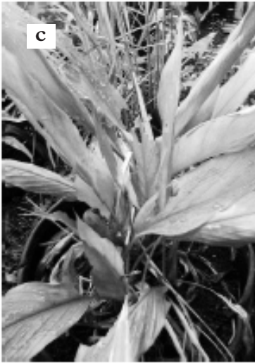
Figure 3. Plectranthus amboinicus (a), Curcuma longa (b), and Artemisia vulgaris (c) growing along the Baybay-Ormoc Highway